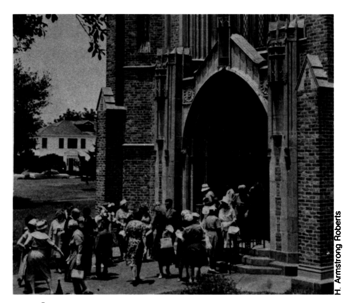
Sunday is observed by many because of the traditions established by men.

a few of the Jews who heard him believed God's truth. But among the Gentiles who heard him, there were many who believed.